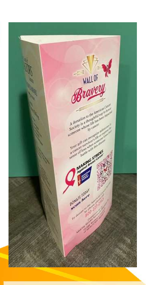
TABLE TENT CARDS

Partners will be featured in this booklet, along with company information and contact information. Advertisements for companies will also be featured. Ad size will depend on the partnership level chosen.